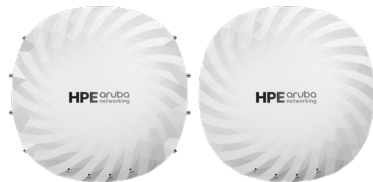
Figure 1. HPE Aruba Networking 750 Series Access Point