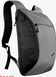
ThinkPad® Ultralight Backpack