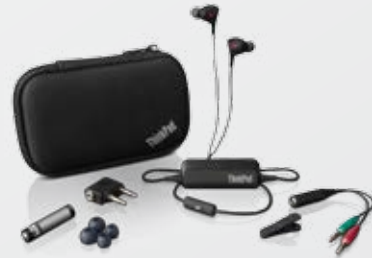
ThinkPad Noise-Cancelling Earbuds