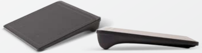
Lenovo® Wireless TouchPad