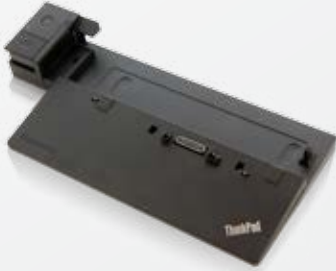
New ThinkPad docking for security, connection, and power