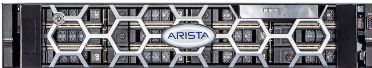
Arista DMF Recorder Node: DCA-DM-RN760

The DMF Recorder Node provides high-performance packet recording, querying, and replay functions. Once connected to the fabric, the DMF controller auto-discovers the recorder node, ensuring a single point of configuration and device lifecycle management. Multiple recorder nodes can be clustered together to present a view of a single, logical recorder node that allows users to store more network traffic for longer periods and retrieve packets from the single logical recorder node interface via the controller. This architecture provides true scale-out characteristics while maintaining the agility and simplicity in the user workflows. The recorder node provides feature-rich capture, query, and replay functions. The recorder node allows the user to replay the specifics of an event to derive the root cause and predict future trends for various performance issues and security threats.