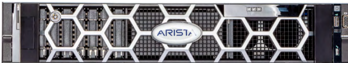
Arista DMF Service Node: DCA-DM-SN760L