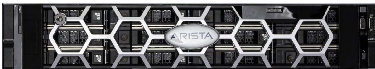
Arista DMF Recorder Node: DCA-DM-RN760L