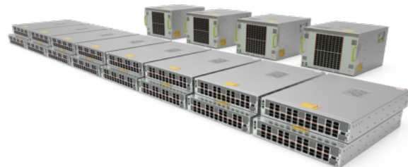
Arista 7700R Distributed Etherlink Switch

Arista Etherlink for AI adds layers of smart, workload specific functionality improving, traffic management, configuration consistency and visibility - critical factors in building, operating and troubleshooting very large clusters and minimizing downtime.