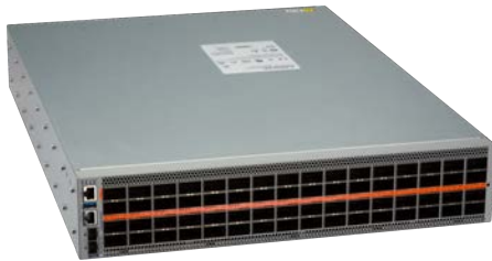
Arista 7060X6-64PE: 64 x 800G OSFP ports, 2 SFP+ ports

The 7060X6-32PE delivers 32 800G ports in a 1RU system with an overall throughput of 25.6 Tbps. The system also has 2 dedicated SFP+ data plane ports. The 7060X6-32PE offers OSFP interfaces, supporting industry standard optics and cables allowing for ease of migration to 800G. All ports allow a choice of speeds including 800 GbE, 400 GbE, 200 GbE or 100 GbE, up to 256 interfaces.