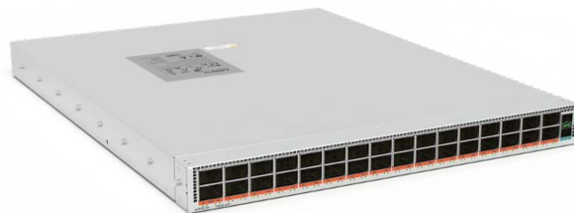
Arista 7060X6-32PE: 32 x 800 GbE OSFP ports, 2 SFP+ ports