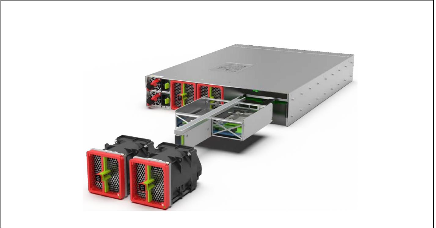
Arista 7060X6 Rear View: Accessing the field replaceable Supervisor card

The Arista 7060X6 series also uses a novel approach for the field replaceability of its components, in the 2RU variants. The Supervisor card can be field-replaced, accessing it by removing the two right-most fan units. This offers several benefits, particularly in terms of simplified maintenance, reduced downtime, increased flexibility, lower TCO, and improved reliability. This state-of-the-art design facilitates robust operational efficiency.