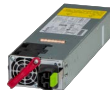
2.4kW Hot swap power supplies