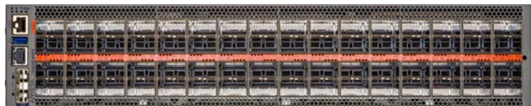
Arista 7060X6-64PE and 7060X6-64PE-B: 64 x 800 GbE OSFP ports, 2 SFP+ ports

Coupled with Arista EOS, the 7060X6 smart switch delivers advanced features for hyperscale networks, server-less compute, big data farms and AI clusters. Scalability, high bandwidth, low latency, traffic management and prioritization, network security, rich telemetry and instrumentation are the cornerstones for the next generation networks.