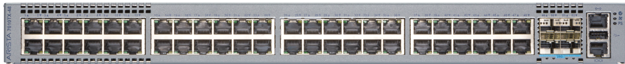
Arista 7010TX-48 and 7010TX-48C: 48 port 10/100/1000 and 4 port 10/25GbE Switch

Each of the four SFP ports supports a choice of speeds with flexible configuration between 1GbE, 10GbE, or 25GbE. All ports can operate in any supported mode without limitation, allowing easy migration from lower speeds and the flexibility for deployment over existing fiber infrastructure.