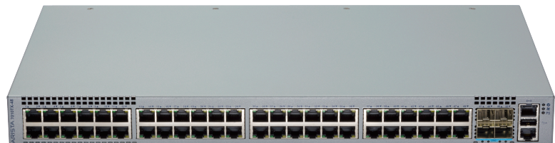
Arista 7010TX-48, 7010TX-48C, 7010TX-48-DC and 7010TX-48C-DC: 48 port 10/100/1000 and 4 port 10/25GbE Switch

The 7010TX-48, 7010TX-48C, 7010TX-48-DC and 7010TX-48C-DC all provide 48 10/100/1000Mb RJ45 ports and 4 SFP ports for 1G, 10G or 25G uplink connections with a full range of optics and cables. The Arista 7010X switches offer low latency under 3 microseconds and a packet buffer of 4MB that is fully shared and allocated dynamically to ports that are congested. Consuming just 0.3 W per gigabit, the 7010X are power efficient with choices of AC and DC power, power redundancy along with hot-swap fans supporting both forward and reverse airflow in a single system.